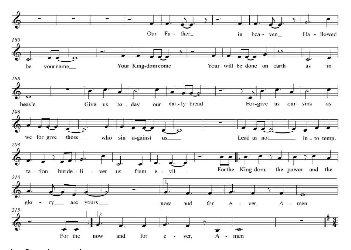
Lamb of God - O. Alstott

The Lord's Prayer All rights reserved. © 1984 Angela Reith. Reprinted with permission from the composer.